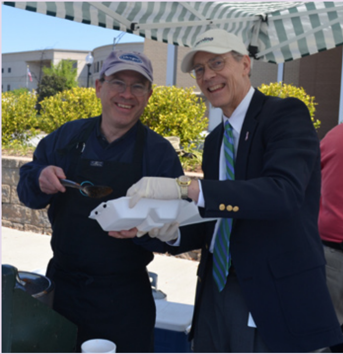
Hot Dog! In late March, Carolina Alliance held its fourth annual Hot Dog Luncheon, with all proceeds benefitting the March of Dimes. Many thanks to all who helped and/or bought a hot dog.